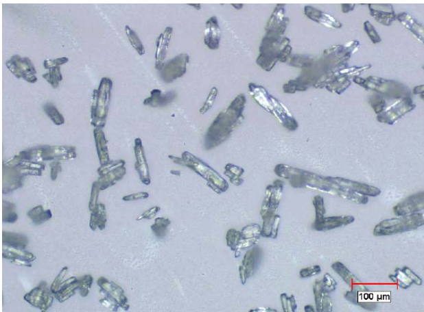
Figure 1: Original image at 100x.

Demonstrate the ability of the Clemex Vision image analyzer to evaluate size and shape of elongated particles.