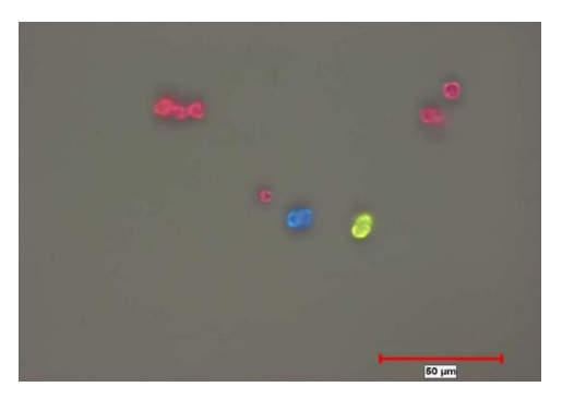
Figure 2: The toner particles viewed at 500X.